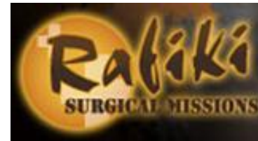
Rafiki Surgical Missions (Tanzania)