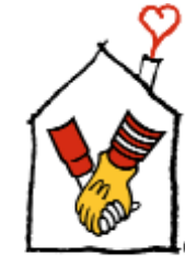
Ronald McDonald House WA