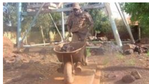
Blackrock Stakes Charity Race (Pilbara)