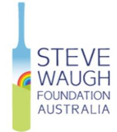
Steve Waugh Foundation Australia